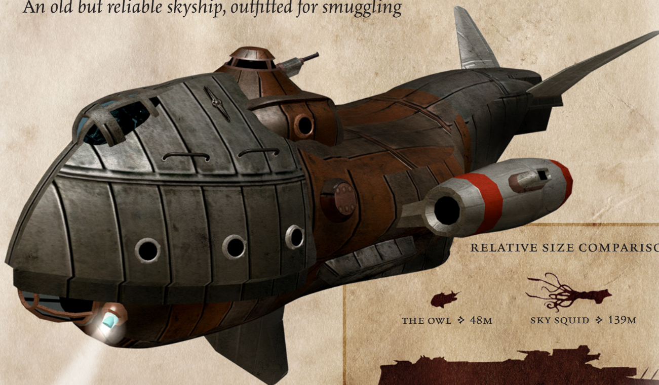
RELATIVE SIZE COMPARISON

An old but reliable skyship, outfitted for smuggling